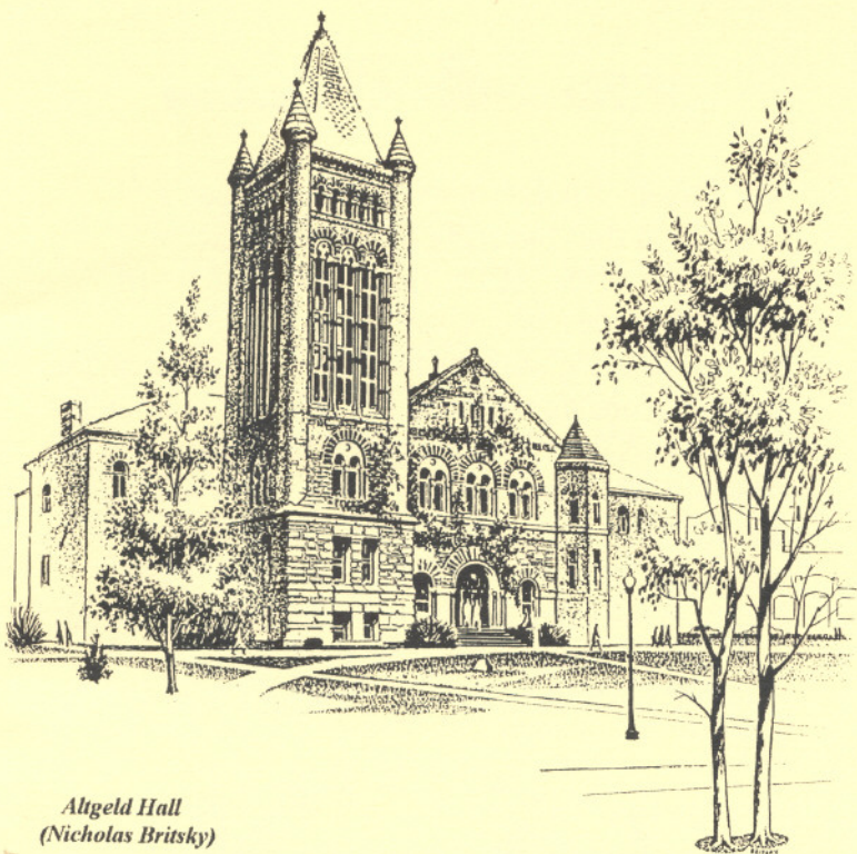
Altgeld Hall